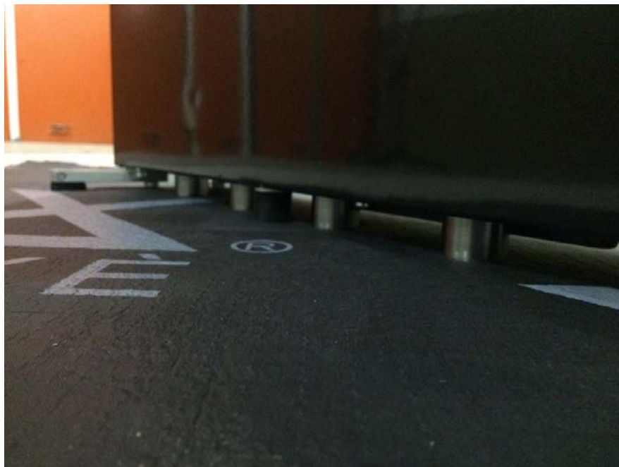
Figure 2: Tapping machine on sample in position 4