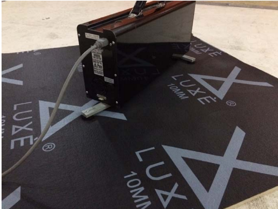
Figure 1: Tapping machine on sample in position 1