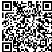
X260 MEDI-VET® (ANTIMICROBIAL)