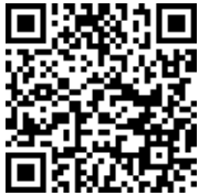
X220 MOISTURE FIX®